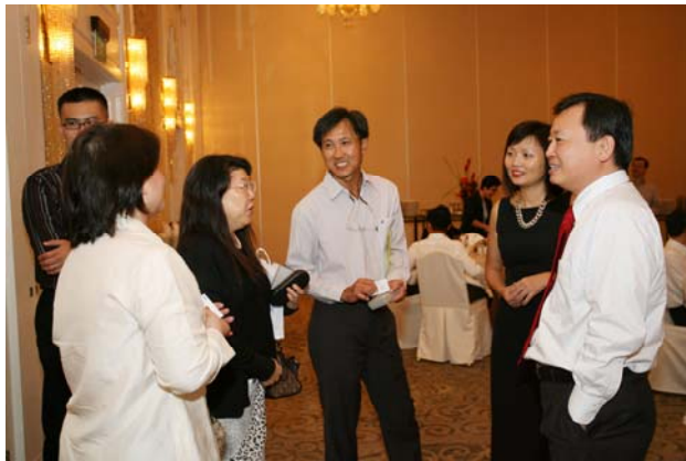
Above: Recognise some familiar faces?

The IIAS had our 32 nd Annual General Meeting (AGM) on 23 July 2008. The AGM was held at Inter-Continental Singapore. We saw a great turnout of 99 members. As a token of appreciation from IIAS for members' continuous support, each member who attended the AGM was given an 8Gb thumb drive with IIAS logo printed on it!