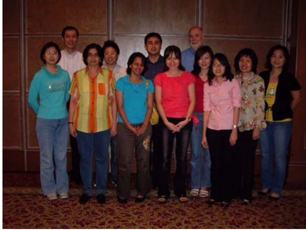
Above: Class from Facilitated results using CSA (Apr 08)