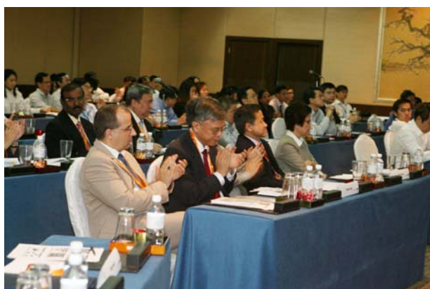
Above: Participants at the IIAS Conference..

the commercial gaming industry. Inevitably, there will be a surge for competent auditors to ensure proper compliance with regulations. So Internal Auditors “Be Prepared”!