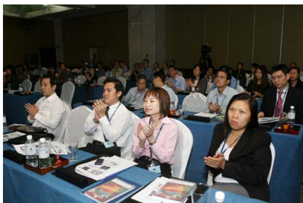
Above: Participants at the IIAS Conference.