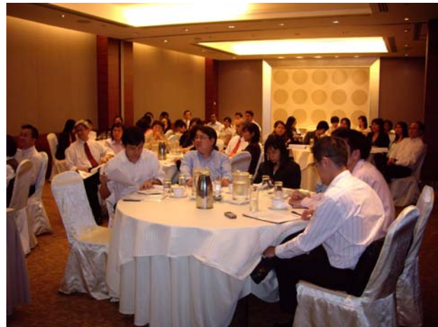
Above: Participants at the evening talk on "Scandals, Lessons Learnt & Controls"